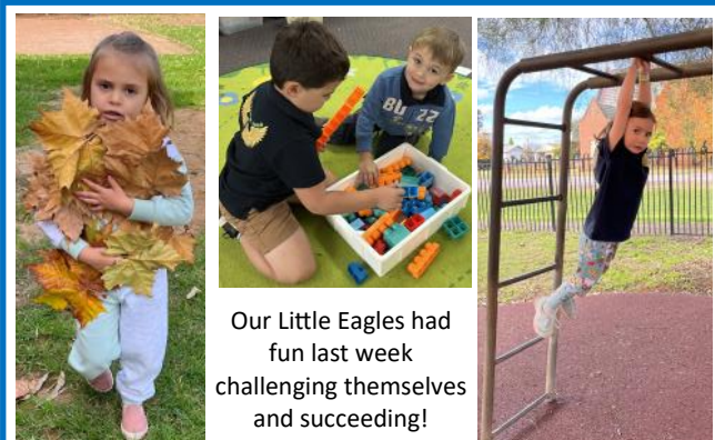
Our Little Eagles had fun last week challenging themselves and succeeding!

Permission notes with the full details have been sent home with primary students and are due back by Friday, 3rd June.