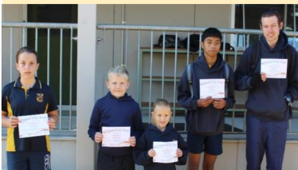
Week 1 Student/Teacher Merit Award Winners:

Year 11: English Studies Primary Industries