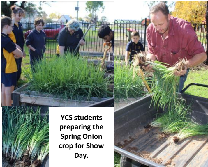
YCS students preparing the Spring Onion crop for Show Day.

A REMINDER THAT TUESDAY MAY 17 IS A PUBLIC HOLIDAY IN YEOVAL FOR THE 2022 YEOVAL SHOW