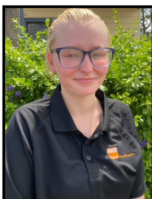
Tallia— Lavish Coffee and Cuisine

At Yeoval Central School we are respectful, responsible and cooperative. Our PBL focus areas for Term 4 Weeks 6-10 are: