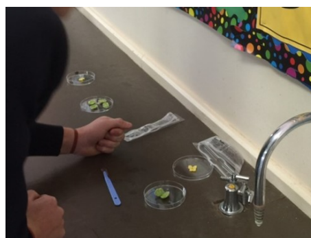
Students examining the difference between monocot and dicot seed