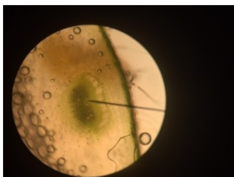
Xylem & Phloem under the microscope