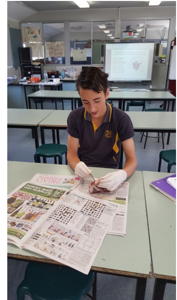
Year 8 students investigating the relationship between the structure and function of different sections of a mammalian heart through a hands on dissection of a lambs heart.